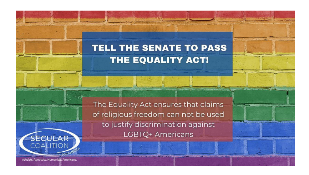
Tell the Senate to Support the Equality Act - Secular Coalition for America

nothing to change that. Additionally, 21 states have had similar nondiscrimination laws on the books for decades now and they have worked, as there have been no increases in public safety incidents in bathrooms since they were codified.